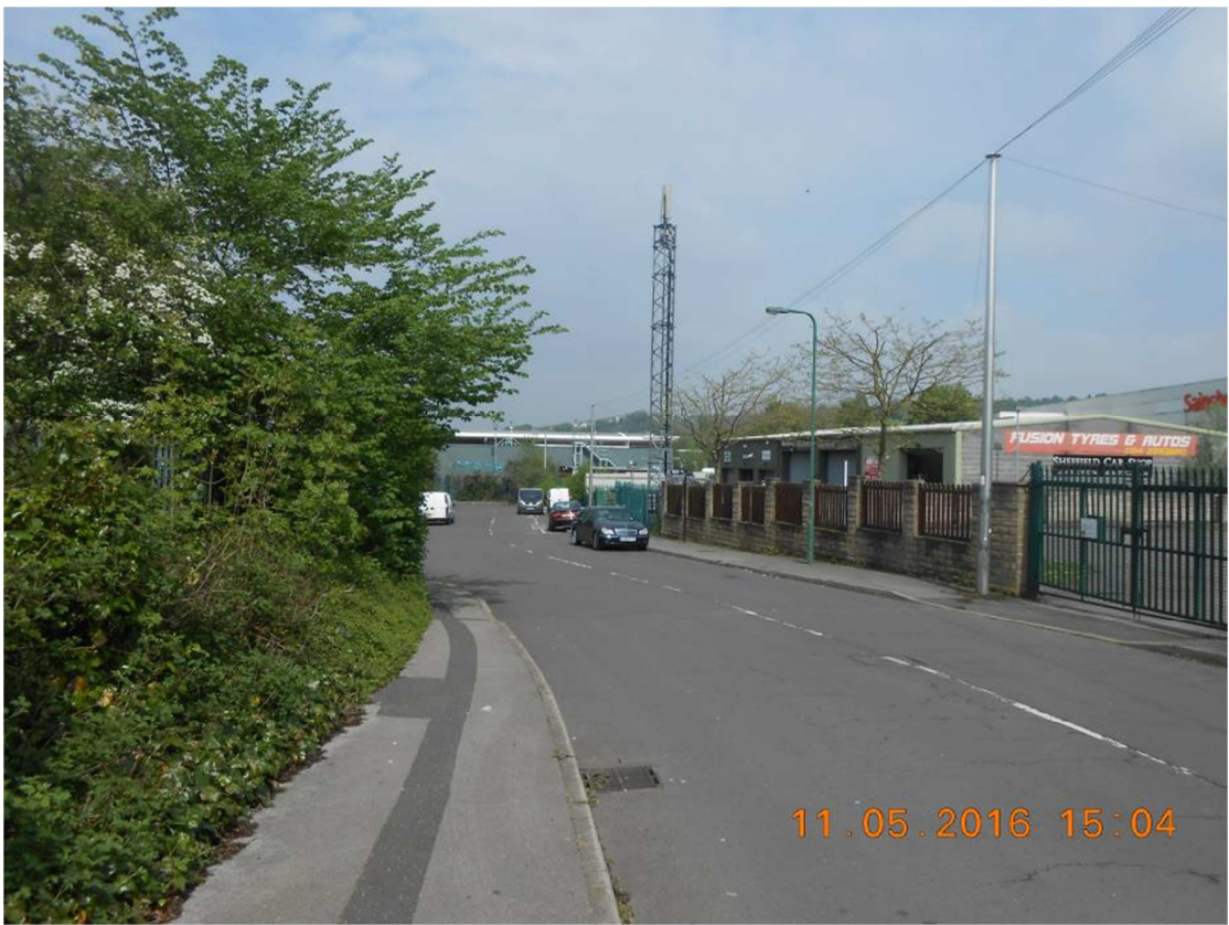
Figure 1 example of fencing on Old Station Drive