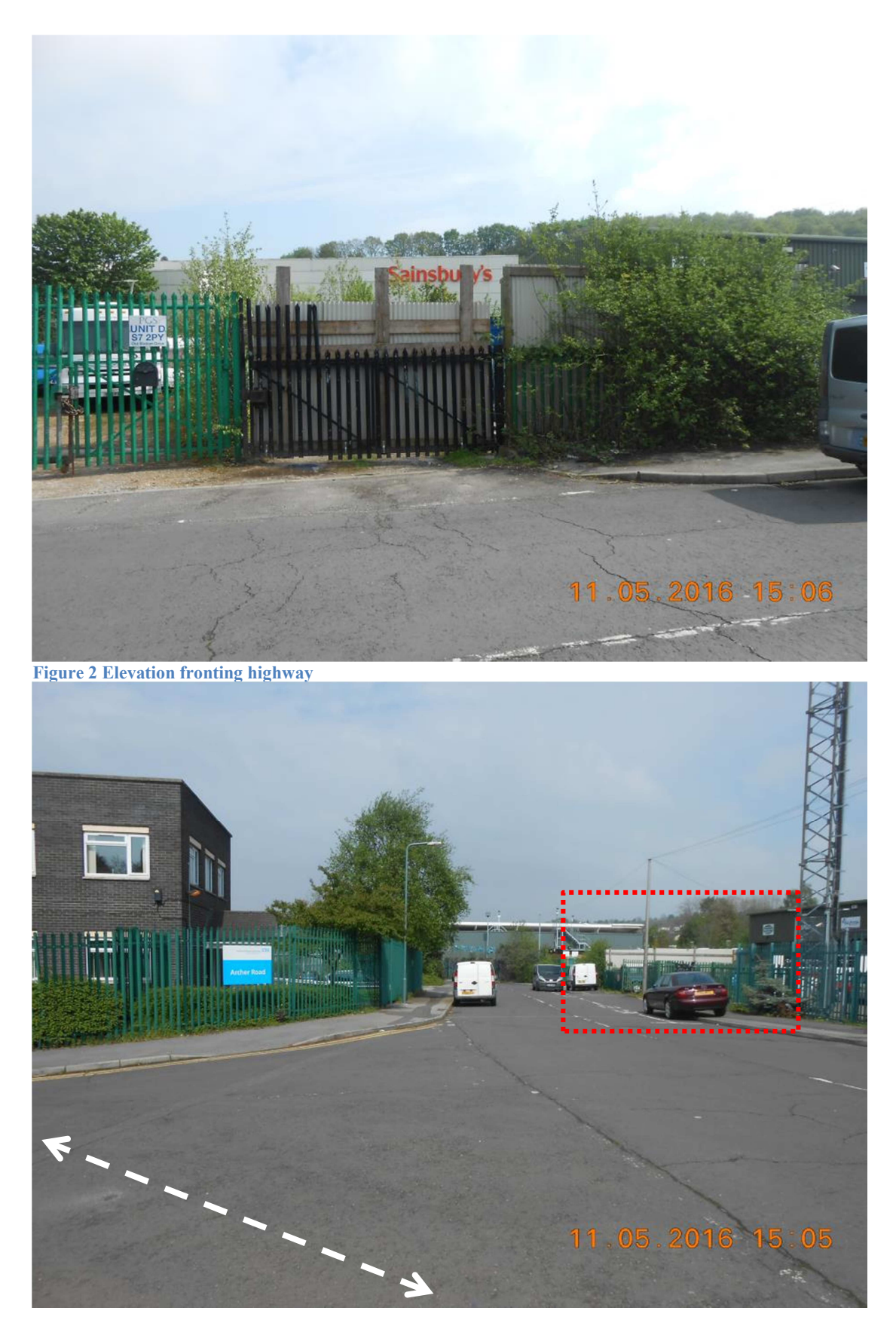
Figure 3 fencing in relation to Sheaf River Walk